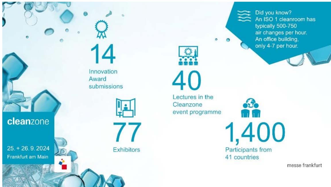
Facts and figures on Cleanzone 2024

A total of 1,400 participants from 41 countries (2022: 1,500 participants from 38 countries) attended the event.